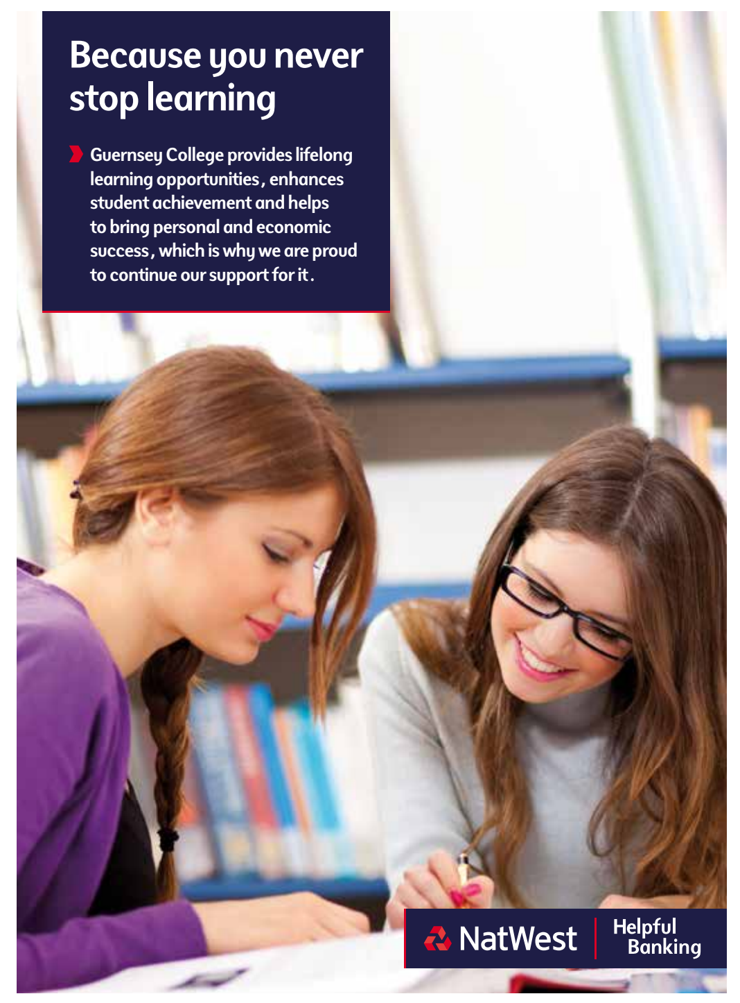
The Royal Bank of Scatland International Limited (BBS International Todating as NatWest, Registered Office: P.O., Box 64, Royal Bank House, 71 Bath Street, 51. Helier, Jersey JE 4891. Regulated by the Jersey Financial Services Commission. Guernesey basiness adulters: JPO Box 62, Royal Bank Pface, 1 Glategys Esplanade, S1. Peter Port, Guernesy, 107 1480. Regulated by the Guernesy Financial Services Commission and Increased under the Banking Spervision (Ballwick of Guernesy). Law, 1994, as amended, the Insurance Managers and Insurance International Stallwick of Guernesy, Law, 1994, as amended, the Insurance Managers and Insurance International Stallwick of Guernesy, Law, 1994, as amended, the Insurance Managers and Insurance International Stallwick of Guernesy, Law, 1994, as amended, the Insurance Managers and Insurance International Stallwick of Guernesy, Law, 1994, as amended, the Insurance Managers and Insurance International Stallwick of Guernesy, Law, 1994, as amended, the Insurance Managers and Insurance International Stallwick of Guernesy, Law, 1994, as amended, the Insurance Managers and Insurance International Stallwick of Guernesy, Law, 1994, as amended, the Insurance Managers and Insurance International Stallwick of Guernesy, Law, 1994, as amended, the Insurance Managers and Insurance International Stallwick of Guernesy, Law, 1994, as a mended, the Insurance Managers and Insurance Managers and Insurance Managers and Insurance Managers and Insurance Managers and Insurance Managers and Insurance Managers and Insurance Managers and Insurance Managers and Insurance Managers and Insurance Managers and Insurance Managers and Insurance Managers and Insurance Managers and Insurance Managers and Insurance Managers and Insurance Managers and Insurance Managers and Insurance Managers and Insurance Managers and Insurance Managers and Insurance Managers and Insurance Managers and Insurance Managers and Insurance Managers and Insurance Managers and Insurance Managers and Insurance Managers and Insurance Managers and