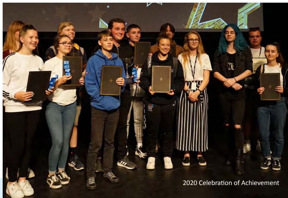
2020 Celebration of Achievement