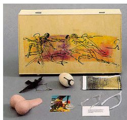
ACT UP Art Box