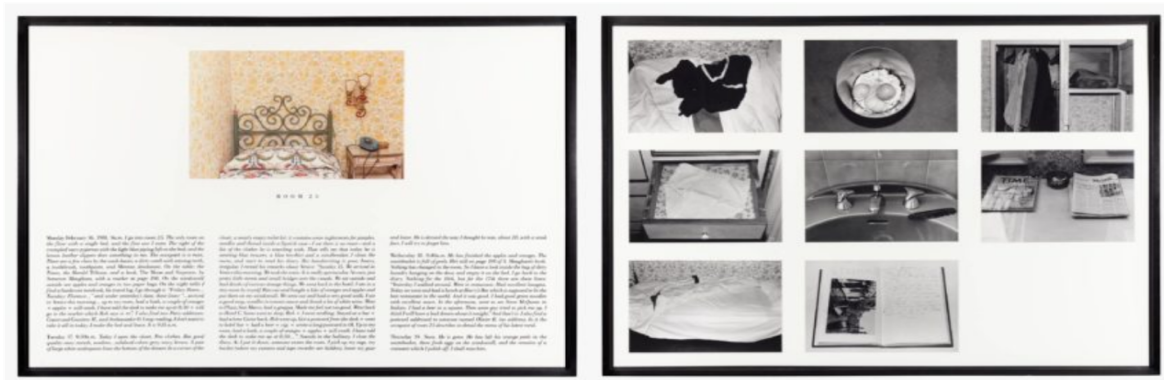
Sophie Calle - The Hotel