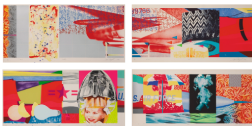
James Rosenquist, f111